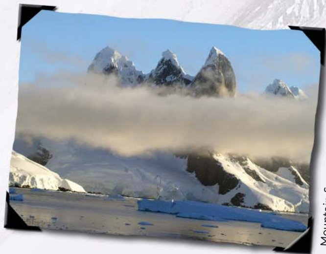
Mountain Sea scape Antarctica.